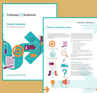
In depth Ambassador Guide